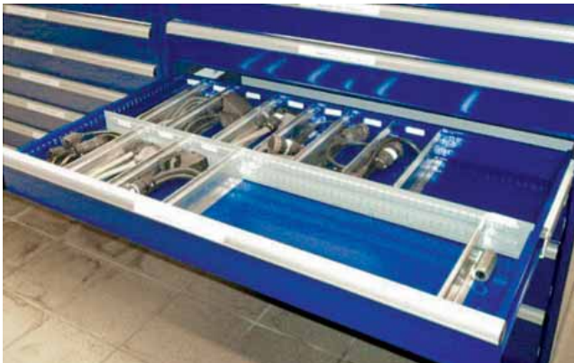
Drawers store tools up to 42" long.