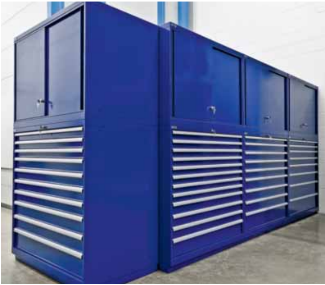
Stacked sliding door shelf cabinets over drawer cabinets.